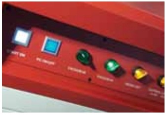
Easy to use operator panel