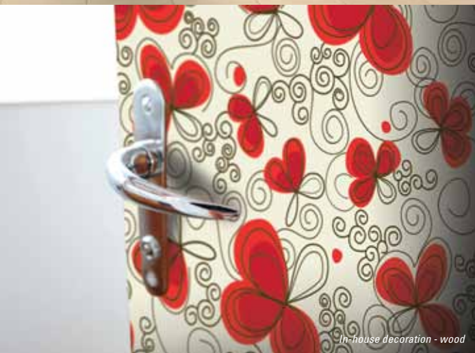
In-house decoration - wood