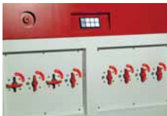
Switches to activate either of the 8 vacuum compartments