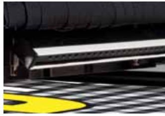
Shuttle safety sensors