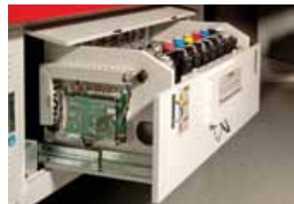
Ink control tray